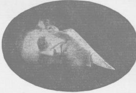
CHAS. T. RUSSELL