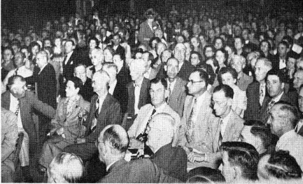
A View of the audience at one session—looking to the right from the platform.