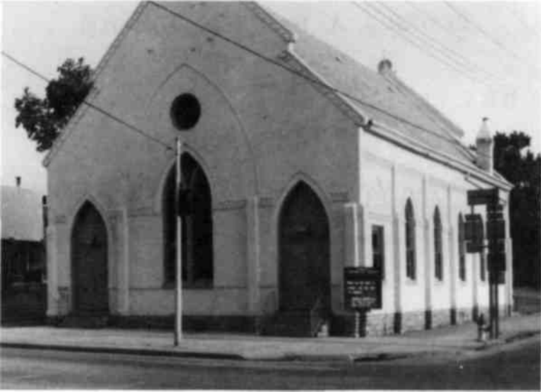
Fairfax Church building in Winchester, Kentucky. Constructed in 1891