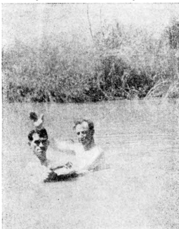
A REAL PHOTOGRAPH

not then glorified the cross by his death. The cross and the "sign of the cross" did not begin to be regarded with superstitious reverence until after the days of Constantine. After he saw his vision of the cross in the sky and the Latin words, " In hoc signo vinces, " the Roman Catholics began to put crosses upon their church buildings, to wear crosses